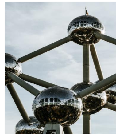
AVERTIM BELGIUM Avenue Louise 326 B - 1050 Brussels

Avertim is a European innovation and management consulting group recognized as a trusted partner by top players in multiple sectors. We support our clients in managing their challenges and achieving their complex transformation programs. The diversity of our activities and the strong cooperation between our different offices have allowed us to build a corporate culture based on diversity, inclusion, and mutual respect .