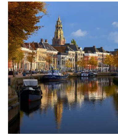
AVERTIM NETHERLANDS Gustav Mahlerplein 2 1082MA Amsterdam