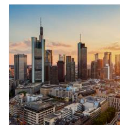
AVERTIM GERMANY Friedrich-Ebert-Anlage 36 60325 Frankfurt