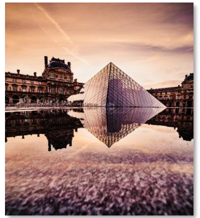
AVERTIM FRANCE 36 Avenue Hoche 75008 Paris